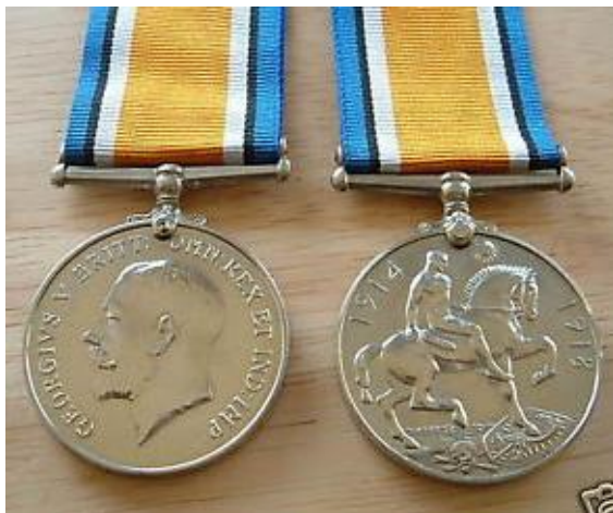
British War Medal