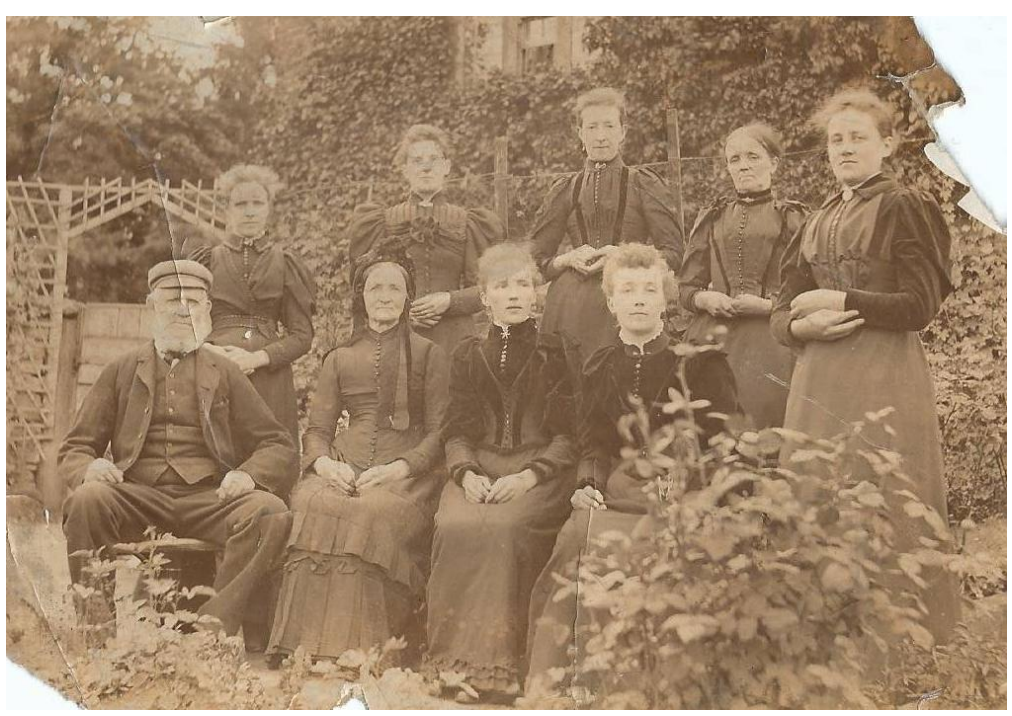
The Armitage family at Calf Croft Cottages