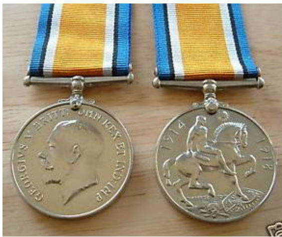
British War Medal