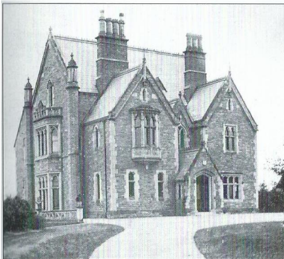
Hopton Grange Lodge