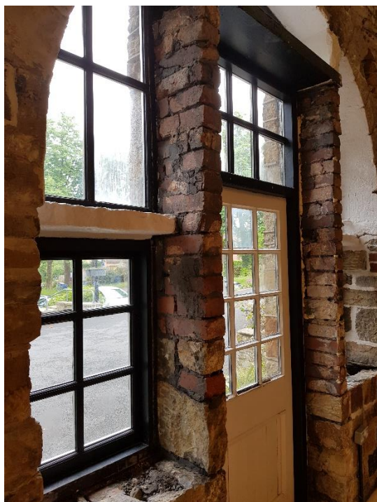
Extremely rough brickwork revealed