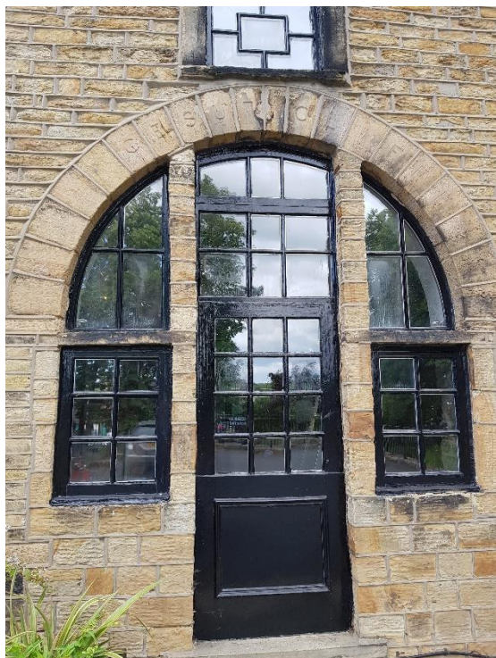
The old door & windows were rotting and windows 'blown'