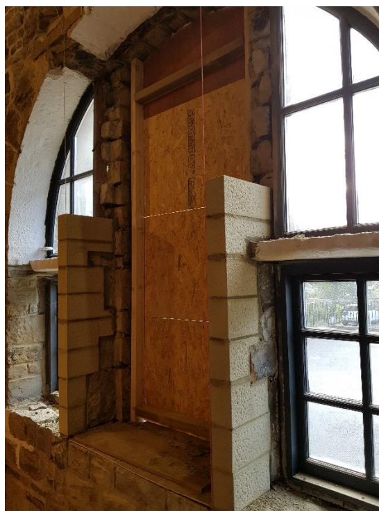
Specially cut stone put in place