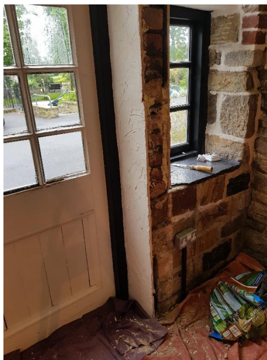
Removal of the damaged plasterboard inside