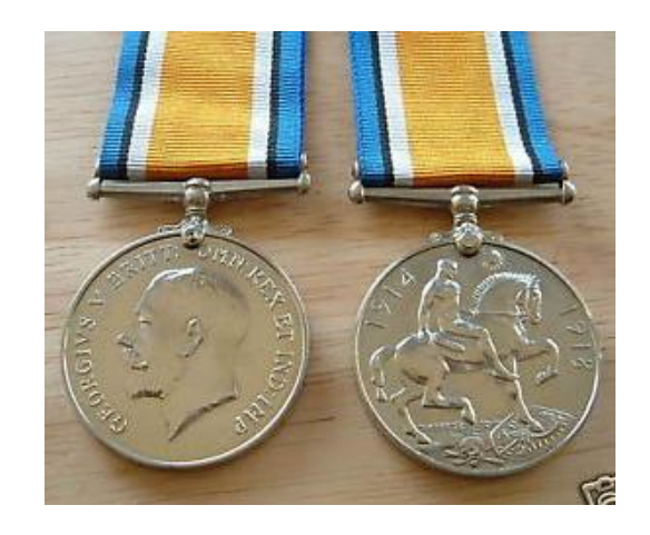
British War Medal