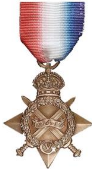
1914 - 1915 Star