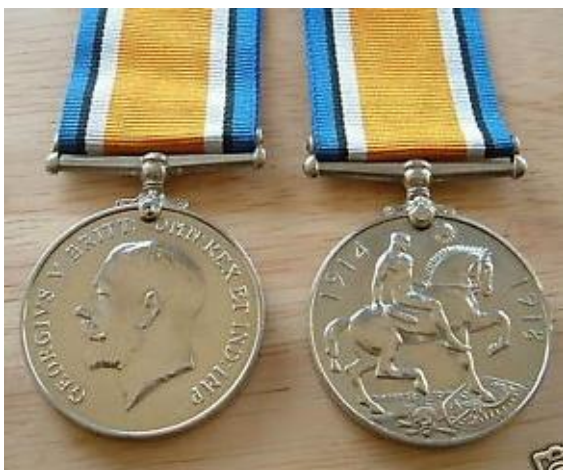
British War Medal